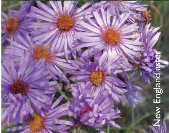
New England aster